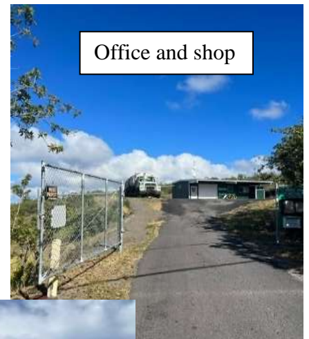
Office and shop

Replace and Ospho metal poles to remove rust and protect with metal paint.